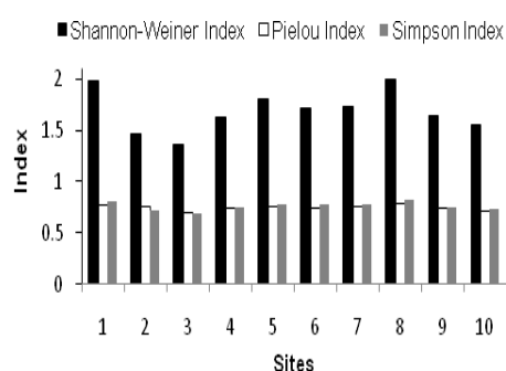
Figure 1.1 Analysis of the gene diversity of bacterial communities

At least thirty-four terminal restriction fragments (T-RFs) were detected in all samples. The 10 samples had different bacterial compositions and predominant types. However, the Shannon-Weiner diversity in all the samples was low; the highest value was two, which indicated that the ecological status of Beiyun River was fragile. The richness, diversity, and evenness in sample NO.2 and NO.3 were generally lower than other samples (Figure 1.1). The dominant T-RFs were 37bp, 38bp, 39bp, 67bp and 218bp in natural water environment, they are widely distributed and quantity relatively stable. The BBCs of 10 samples could be divided into five clusters. The bacterial communities in closed water areas like reservoir and floodgate have large differences with flux in Beiyun River.