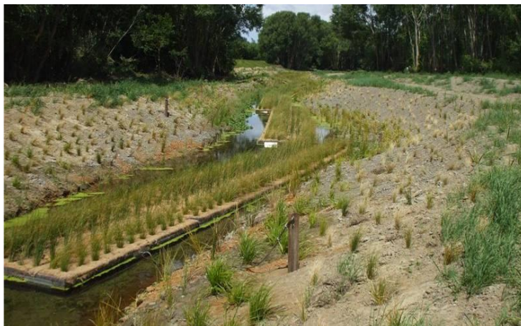
Figure 3. In-channel application of FTW for treatment of agricultural drain-flows into the Tukipo River, Hawkes Bay.