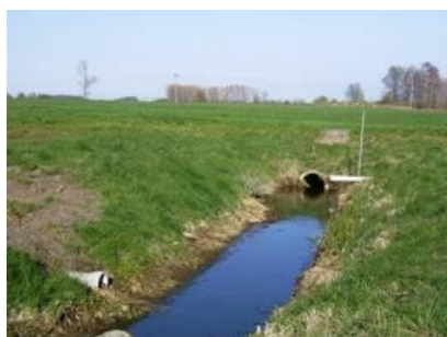
Figure 2 Piped waterway (Krämer 2006).

All these measures are assessed concerning their efficiency in the scope of a reduction of diffuse nutrient emissions, partly accompanied with pilot projects to measure their retention effects.